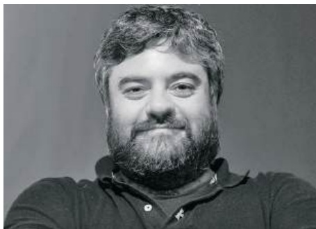
Miguel Angel Jimenez