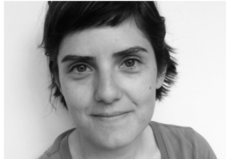
Producer Gökçe Işıl Tuna